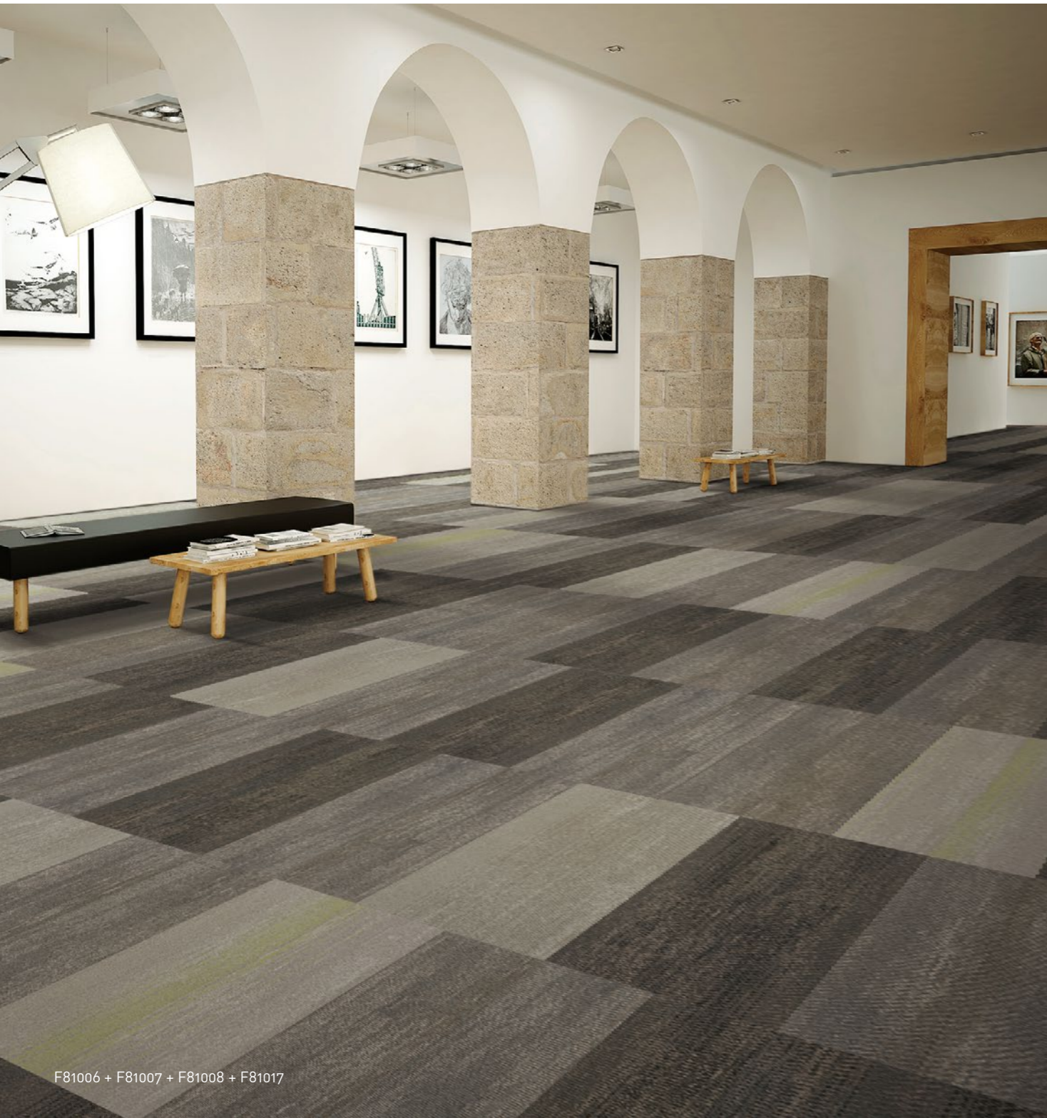
F81006 + F81007 + F81008 + F81017

Carpet surface villi can capture, adsorb floating dust particles in the air, effectively improve indoor air quality.