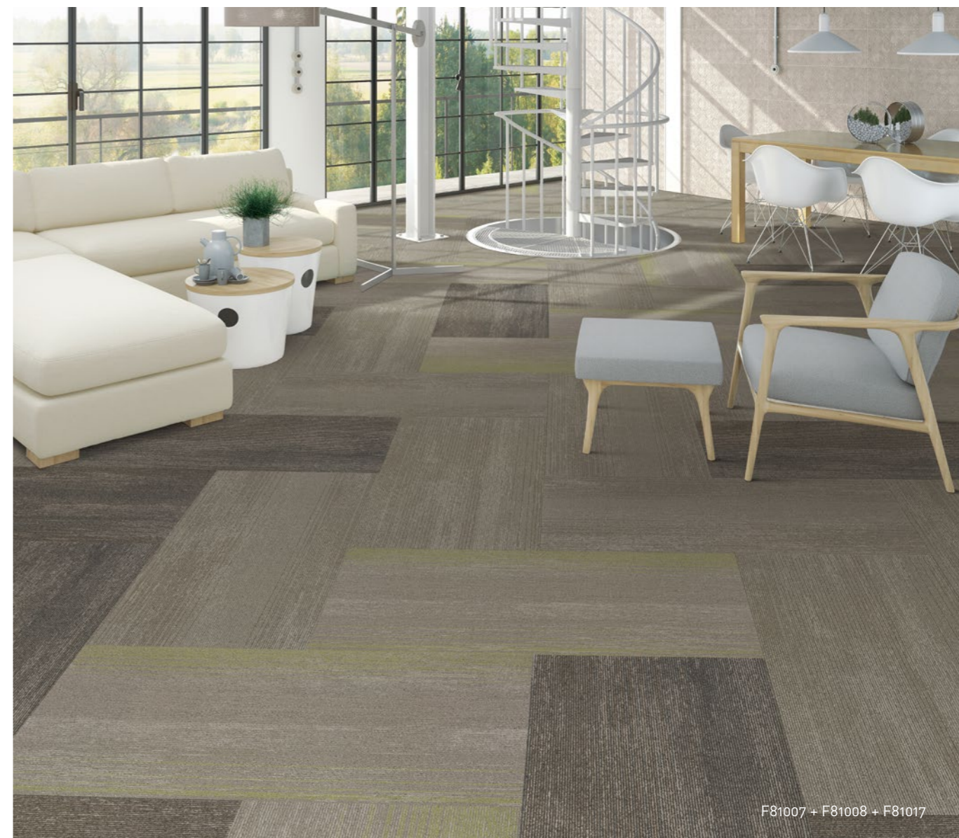
F81007 + F81008 + F81017