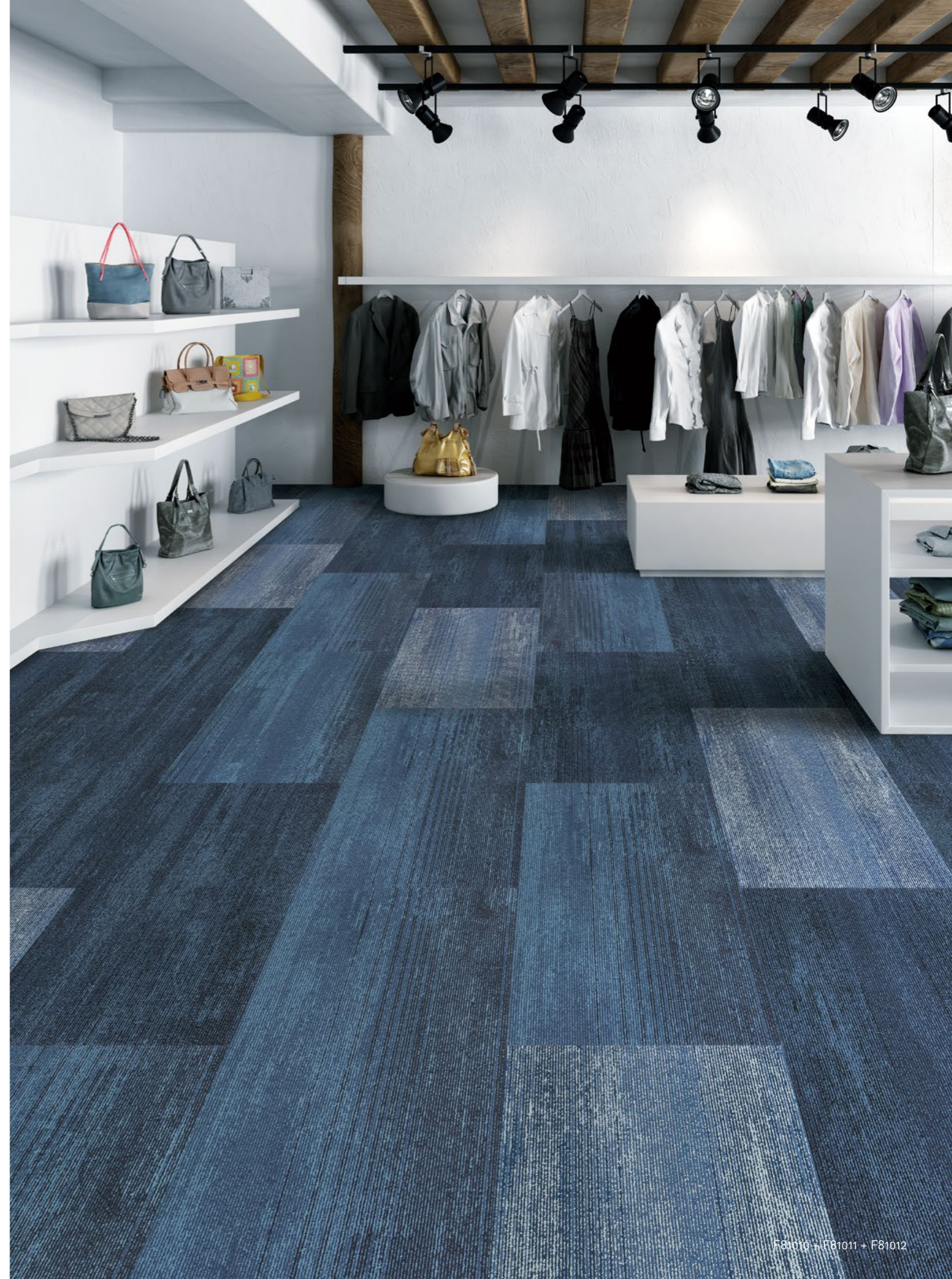
F81010 + F81011 + F81012